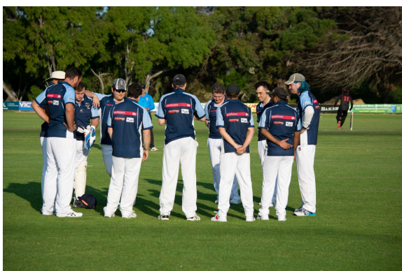
The T20 side gets a pep talk between innings in the game against Macclesfield