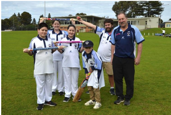
It was great having so many families at the club this season