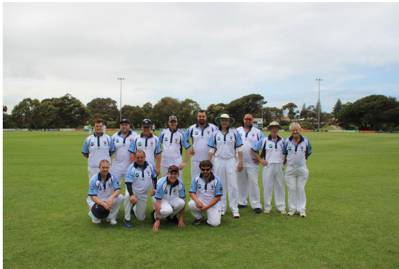
The C2 side before their first game on the new turf pitch at Victor Harbor Oval