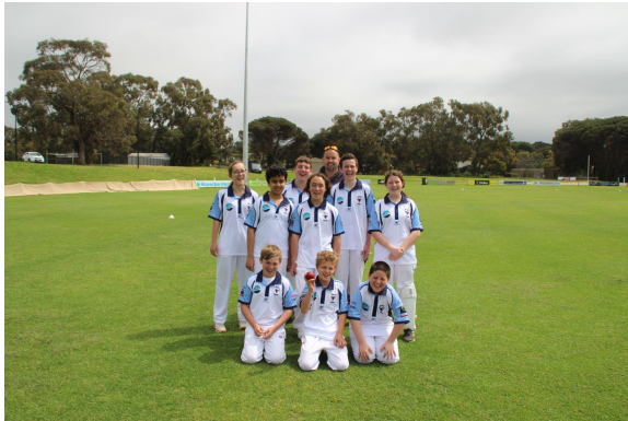
The Junior Colts enjoyed their first day of the season