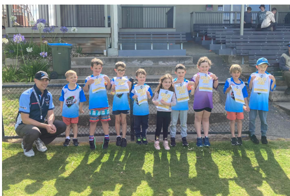
Our Woolworths Cricket Blast program was a success