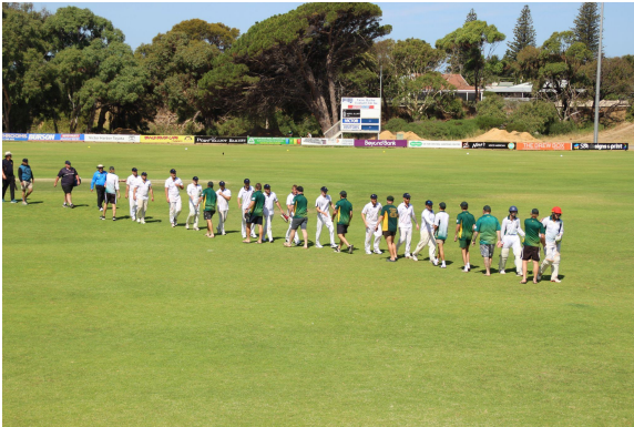
Great Southern and Murray Towns shake hands after a gripping Meyer Shield match at Victor Harbor Oval