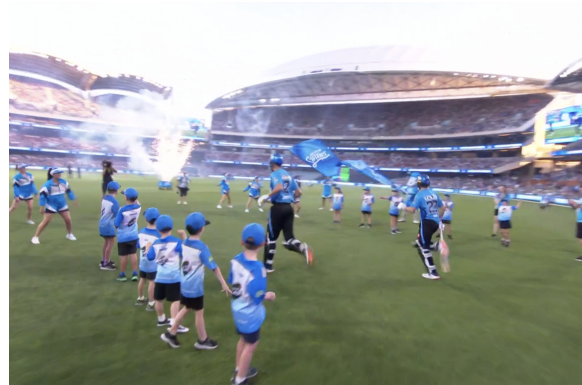
Our Woolworths Cricket Blast participants welcome the Adelaide Strikers onto the field